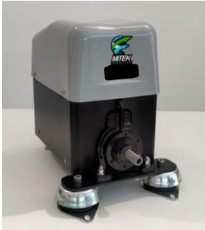
Powertrain 4 kW

Motor + controller, gearbox, flange, cooling plate, pump, heat exchanger, throttle, display, cable kit anodized case