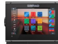
5" DISPLAY SIMRAD