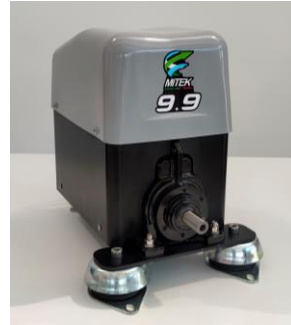
Powertrain 7 kW

Motor + controller, gearbox, flange, cooling plate, pump, heat exchanger, throttle, display, cable kit anodized case