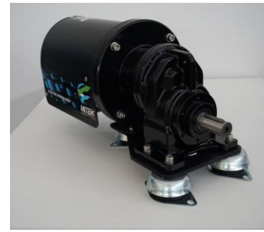
Powertrain 15 kW

Motor + controller, gearbox, flange, cooling plate, pump, heat exchanger, throttle, display, cable kit anodized case