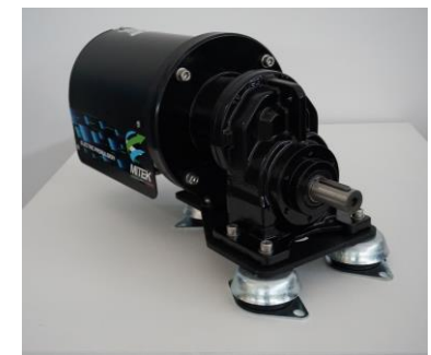
Powertrain 20 kW

Motor + controller, gearbox, flange, cooling plate, pump, heat exchanger, throttle, display, cable kit anodized case