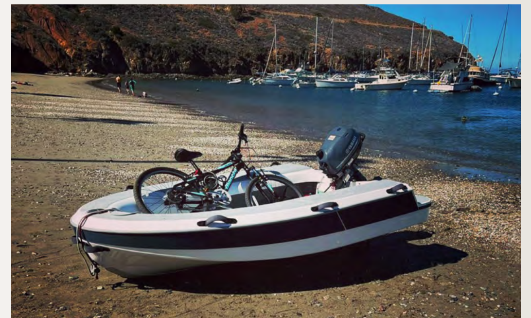
Carry all your toys