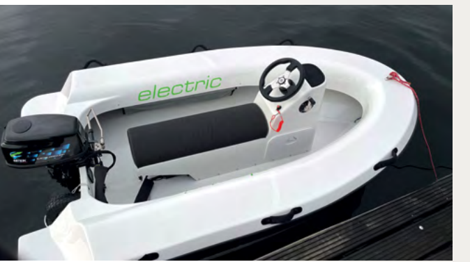
30kg hull weight